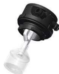
bayonet plug IV B4N100